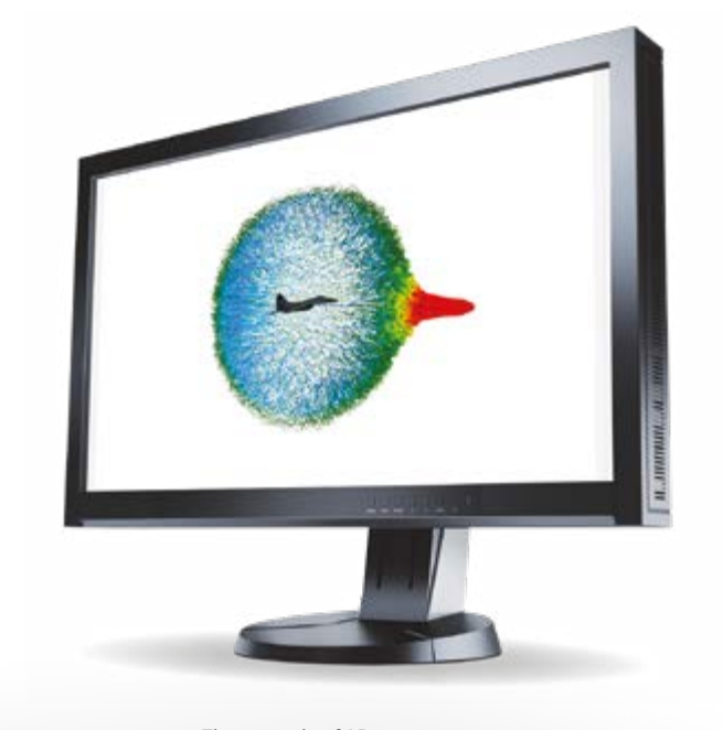
The example of 3D antenna pattern

ERA a.s. Průmyslová 462 530 03 Pardubice Czech republic